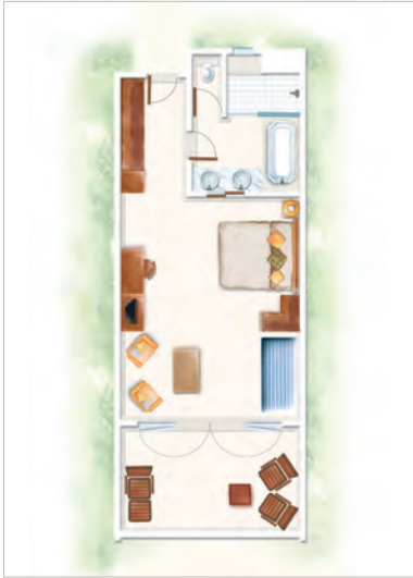
Superior Room First Floor