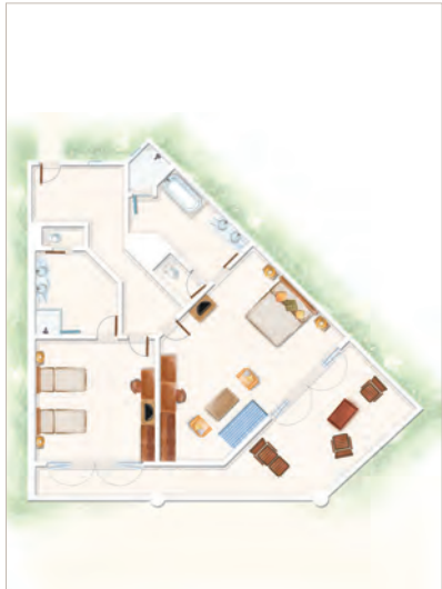
2-Bedroom Family Apartment