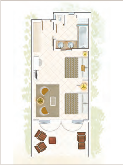
Deluxe Room / Deluxe Ground Floor