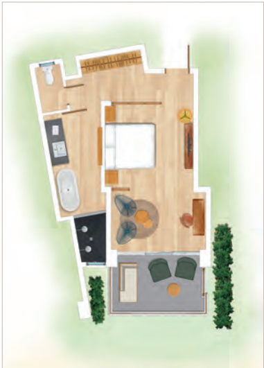
Ocean View Room